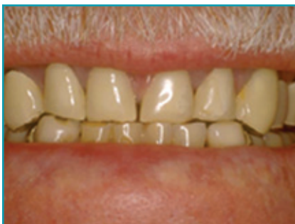
Worn teeth due to bruxism